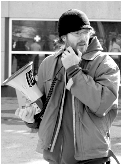
Above: Friends of the Lubicon member addresses a rally, 2008