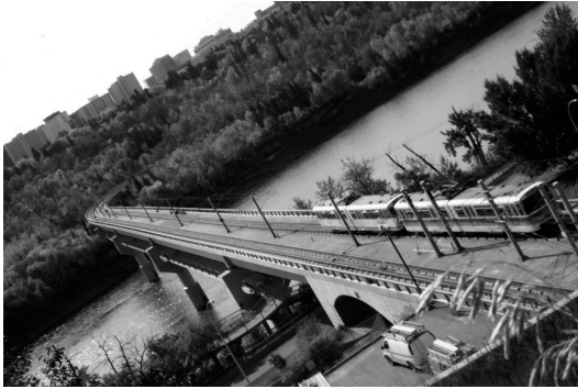
Above: APIRG Working Group TRUE compiled experience reports from ETS riders, 2008.

Working Groups faced a variety of challenges within their groups, including recruitment and retention (particularly when key members graduate or move on), board organization, event attendance, effective outreach and promotions and positive group dynamics.