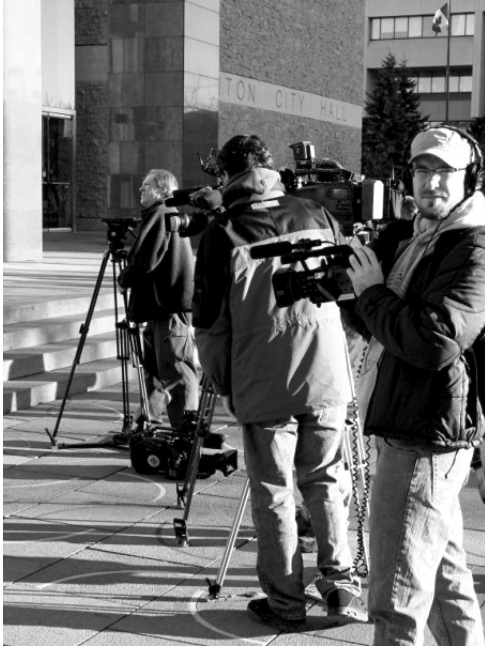
Above: Active Citizens Television (ACTV) filming footage for Transit Riders' Union of Edmonton (TRUE) documentary, 2008