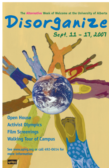
Above: Poster from Disorganize , September, 2007

Finally, APIRG promoted the Day for Darfur Die-In and co-presented the film “All About Darfur” with Stand for Darfur and the Edmonton Small Press Association.